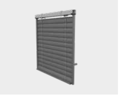
SKY K80 Rail-guided with concave aluminium slats. Cable guide optional. Max. width 5000 mm Max. height 5000 mm

External Venetian blind with aluminium slats and guide rail. Cable guide optional. Max. width 5000 mm Max. height 5000 mm