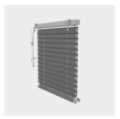
CONTINENT 50 Cable-suspended standard external blind with 50 mm aluminium slats. Max. width 2800 mm Max. height 2500 mm