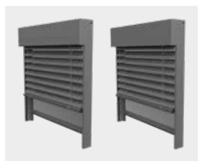
SKY-MULTI PELMET IR SKY-MULTI PLASTERED PELMET IR Pelmet screen / plaster base variants with integrated insect screen roller blind Max. width 1800 mm Max. height 2500 mm