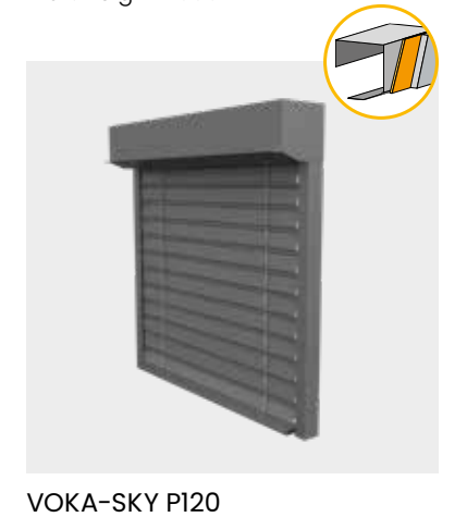
Protruding, extruded Roller shutter headbox as flushmounted variant and Venetian blind slat curtain. Max. width 4000 mm Max. height 4000 mm