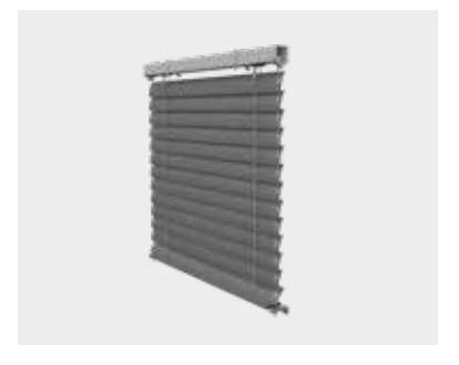
SKY F80 Venetian blind with flat aluminium slats and cable guide. Rail-guided system optional. Max. width 5000 mm Max. height 5000 mm