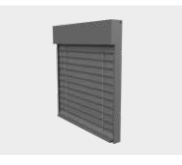
SKY-MULTI PLASTERED PELMET Self-supporting Venetian blind for plastered pelmet mounting. Max. width 5000 mm Max. height 4000 mm