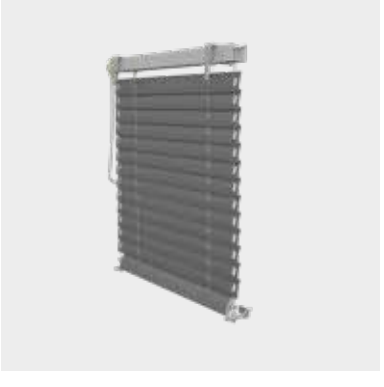
DIPLOMAT 50 Cable-suspended standard external blind with 50 mm aluminium slats. Max. width 3500 mm Max. height 2700 mm