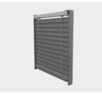
SKY-MULTI CHANNEL BOX Self-supporting Venetian blind for channel box mounting. Max. width 2500 mm Max. height 4000 mm