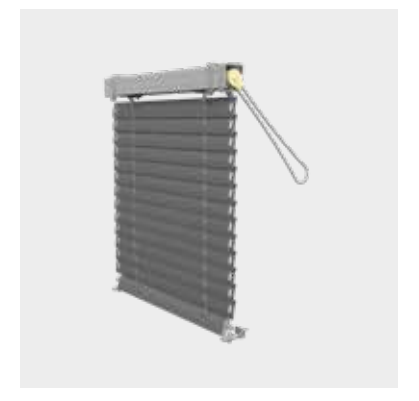
AMBASSADOR 50 Cable-suspended standard external blind with 50 mm aluminium slats. Max. width 5000 mm Max. height 4000 mm