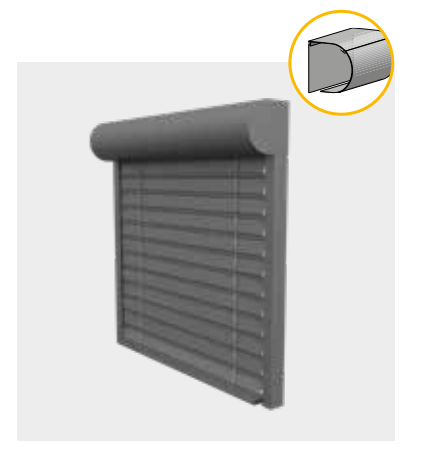
VOKA-SKY R100 Protruding, extruded Roller shutter semicircular headbox with Venetian blind slat curtain. Max. width 4000 mm Max. height 4000 mm