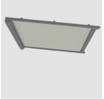
XLIGHT R120 Under-glass awning Intended for mounting underneath a glass roof. The fabric is protected from weathering.