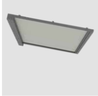
XLIGHT E150 The under-glass awning with a cubic design sits flush between the fallbar profile and the end of the guide track when extended, ensuring continuous shading.