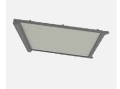
XLIGHT R120 Under-glass awning Max. width 5,000 mm Max. projection 5,000 mm