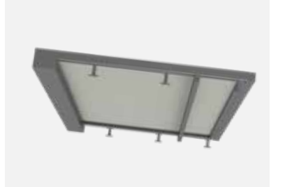
XLINE E210 Conservatory awning. Max. width 6,000 mm Max. projection 7,000 mm