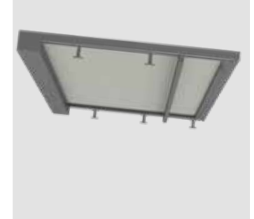
XLINE E210 The conservatory awning The conservatory awning with cubic design features a headbox that can be positioned facing up or down on installation.