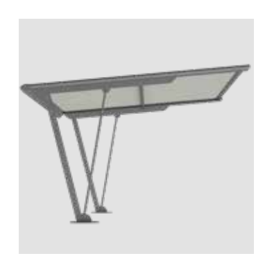
FREELINE The free-standing awning can be positioned anywhere on your patio or in your garden without an existing construction.