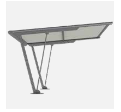
FREELINE Free-standing awning Max. width 5,000 mm Max. projection 5,000 mm

FREELINE is suitable for providing free-standing shade for patios and outdoor seating areas. The system was developed on the basis of the PERGO-LINE awning and does not need to be attached to a building. The system is mounted free-standing on two steel supports, which are anchored to a concrete foundation.