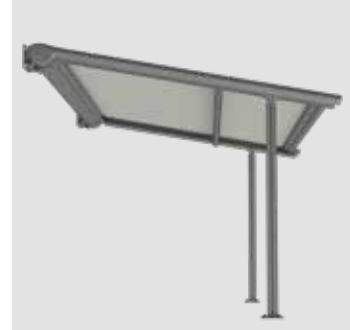
PERGO-LINE R154 The pergola awning Shades large patio areas without additional supporting structure. The sturdy vertical supports protect you from sun and weather.