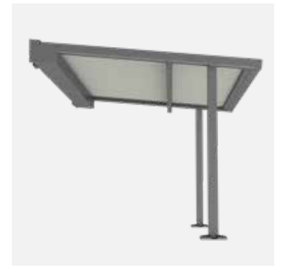
PERGO-LINE E210 Max. width 6,000 mm (optionally extendable) Max. projection 7,000 mm