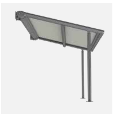
PERGO-LINE R154 Pergola awning Max. width 6,000 mm (optionally extendable) Max. projection 7,000 mm