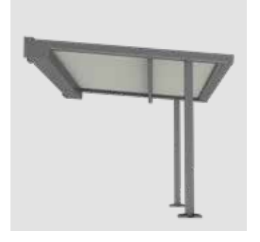
PERGO-LINE E210 The pergola awning with a cubic design sits flush between the fallbar profile and the end of the guide track when extended, ensuring continuous shading.