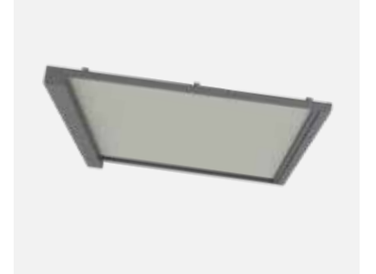
XLIGHT E150 Under-glass awning Max. width 6,000 mm Max. projection 5,000 mm