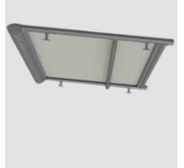
XLINE R154 The conservatory awning Shades your pergola or conservatory and creates a pleasant climate.